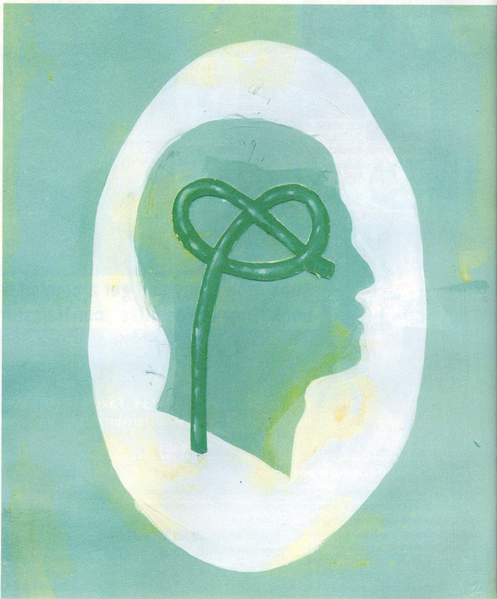
RYAN JACOBS SMITH

It has long been known that some differences exist between male and female brains, but they were widely believed to be restricted to the hypothalamus, which is involved in regulating food intake and